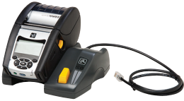
Single-bay QLn Ethernet Cradle