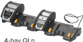
4-bay QLn Ethernet Cradle

Connect QLn printers to your wired Ethernet network via the QLn Ethernet cradle to enable easy remote management by your IT or operations staff — helping to ensure each printer is operating optimally and ready for use. The Ethernet cradle can communicate over 10 mbps or 100 mbps networks using auto-sense.