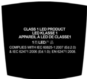
Figure 4.1 SE655 End-Cap Warning Label - Class 1

Class 1 Laser devices are not considered to be hazardous when used for their intended purpose.