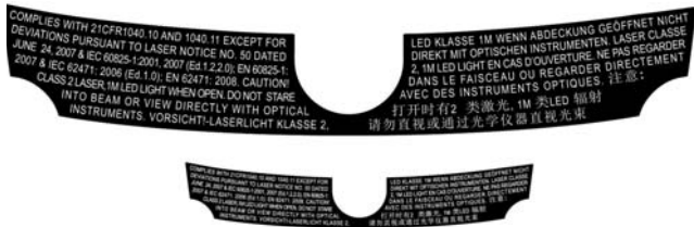
Figure 4.7 SE965 End-Cap Laser Warning Label