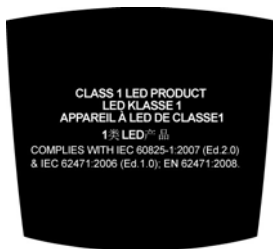
Figure 4.3 SE655 Slim Pod Laser Window Warning Label