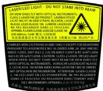
Figure 4.5 SE4500 Slim Pod Laser Window Warning Label