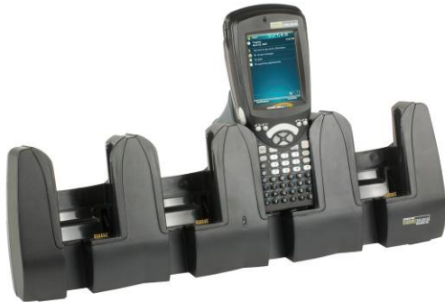
Part No: N/A, Model No: WA4204-G2