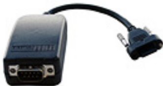
Part No: 1050077, Model No: WA4020-G2

Connects to WA4002, WA4002-G1, and WA4003-G2 desktop docking stations to provide 10/100bT ethernet support.