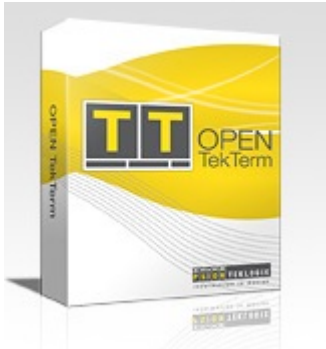
Part No: N/A, Model No: S3010