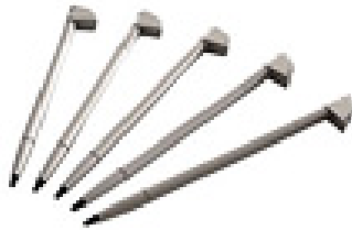
Part No: 1030394, Model No: WA6100-G1

Note: custom mechanical stop may be required for various sizes of cards.