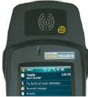
Part No: 1051310, Model No: HF-T2-G2