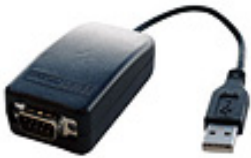
Part No: N/A, Model No: WA4015-G1