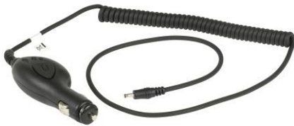
Part No: 1050463-001, Model No: WA3113-G2

The universal power supply is used to provide DC power to the desktop docking station (WA4003-G2) from an AC source or to provide power directly to the Workabout Pro G2 handheld (plugs into DC power jack on base of unit). A power lead is included.