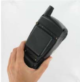
Part No: 1100625, Model No: UHF-CA3-AC5-G2