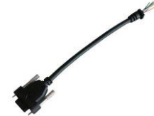
Part No: N/A, Model No: CA2950-G1