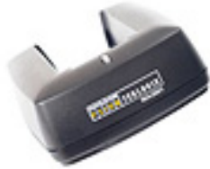
Part No: 1080221, Model No: WA3001-G1