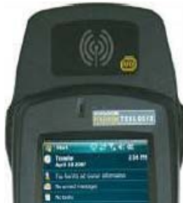
Part No: 1004320, Model No: HF-T2-G2X

Multi protocol High Frequency (13.56 MHz) RFID reader with integrated horizontal antenna. Reader housed inside multi purpose end-cap and is available with GSM antenna shroud only (p/n 1051310). Uses USB interface.