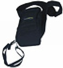
Part No: 1030227, Model No: WA6050