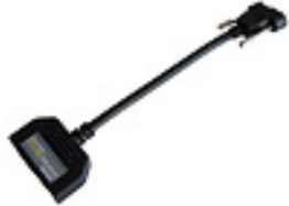
Part No: 1030223, Model No: WA1050