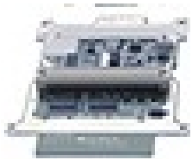
Part No: N/A, Model No: WA9001-G1