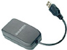
Part No: N/A, Model No: WA4010-G1

Connects to WA4002, WA4002-G1, and WA4003-G2 desktop docking stations to provide RS232 connectivity.