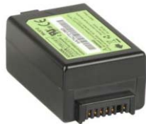
Part No: 1050192-002 Model No: WA3010

The High Capacity Lithium Ion Rechargeable Battery pack provides 3300 mAh of capacity at 3.7 volts. The 3300 mAh battery offers approximately 22% more power than the 2350 mAh battery which makes it ideal for solutions that deploy high-speed WWAN and WLAN radios, data capture devices and other peripherals. The 3000 mAh battery is an Advanced Smart Battery that has a power indicator so that the battery's state of charge is always known. A high capacity battery door is required with the High Capacity Battery.