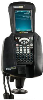
Part No: 1080881-001, Model No: WA1310-G2