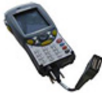
Part No: 1050552, Model No: WA1002