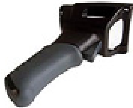
Part No: 1050460-001, Model No: WA6101-G1

This convenient and easy to use soft-shell holster with removable belt and swivel holster pad can be used to hang a WORKABOUT PRO with a pistol grip securely from the waist.