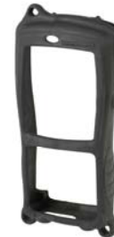
Part No: N/A, Model No: WA6405

Workabout Pro G2 S or Workabout Pro 3 S/Q