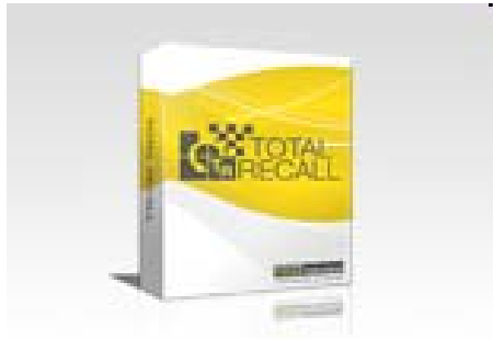
Part No: N/A, Model No: N/A

Win TekTerm is a similar emulation client designed to run on Windows desktop-like computers, like the 8580/8590 vehicle mount computers.