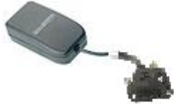
Cable, Tether to Ethernet Adapter