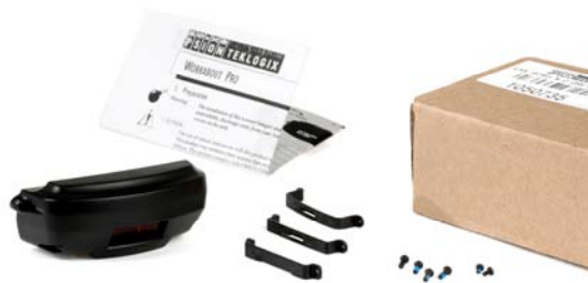
Part No: N/A, Model No: WA9102-G1

The SE1223 Long Range Scanner Module provides high performance and long range 1D bar code scanning. This scanning module reads bar codes up to 6.1 meters (20 feet) away. Only adding an additional 75g of weight to the WORKABOUT PRO, this scanner module ensures that users of the handheld computer can still maintain comfortable one-handed use for an entire shift without muscle fatigue. The scanner module integrates seamlessly into the back of the WORKABOUT PRO with six screws and can be installed with ease. The SE1223 LR Scanner Module supports the following Symbologies: UPC/EAN, Code 128, Code 39, Code 93, I 2 of 5, Discrete 2 of 5, Codabar, MSI UCC/EAN 128, and TriOptic Code 39. An optional Pistol Grip (WA6101-G1) is also available for use with the SE1223 LR module to allow users to convert the WORKABOUT PRO to a convenient pistol grip unit.