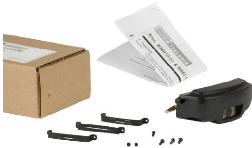
End-Cap 2D Imager, without GSM shroud HHP5180 2D end-cap imager.