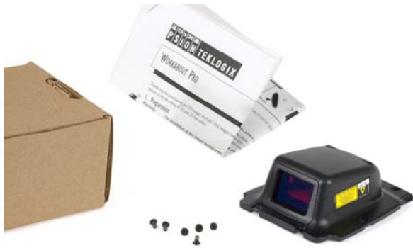
Part No: N/A, Model No: WA9005-G1