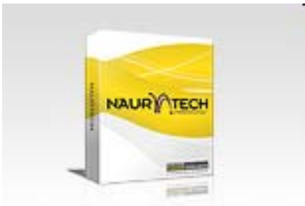
Part No: N/A, Model No: SW2100

Integrates with Psion Teklogix devices for centralized, rapid, hands-off updates to mobile data terminals anywhere in the enterprise. Slashes IT admin costs and greatly improves ROI.