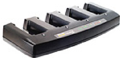
Part No: 1080220, Model No: WA3004-G1