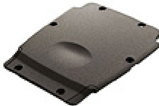
Part No: 1030271, Model No: WA6208

This pack contains 5 replacement styluses suitable for all WORKABOUT PRO models.