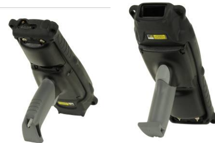
Part No: N/A, Model No: WA6403