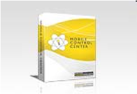
Part No: N/A, Model No: SW2600