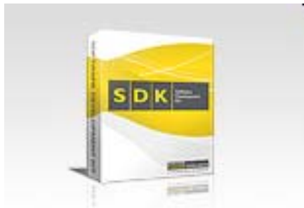
Part No: N/A, Model No: N/A

Protects your apps, device configuration, and data. Features an easy-to-use profile manager and automatic back-up and restore capability. Plus automatic profile restoration after a cold reboot. This utility is provided free of charge and is loaded in the OS of the handheld.