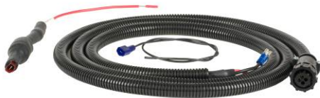
Part No: N/A, Model No: CA1210