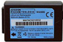
Part No: 1050494 Model No: WA3006