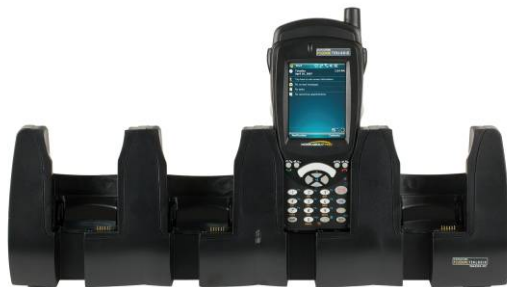
Part No:N/A, Model No: WA4304-G2