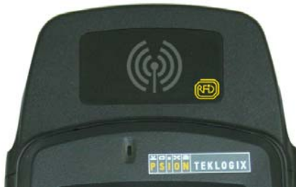
Part No: 1051330, Model No: LF-AH1-G2