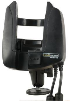
Part No: 1080880-001, Model No: WA1210-G2