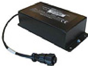
Part No: 19893-600, Model No: PS1300

The automotive adapter fits any standard 12VDC car cigarette receptacle.