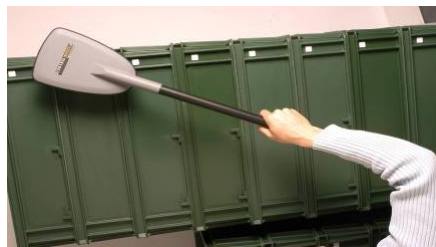
Part No: 1004310, Model No: HF-T2-A3-G2

Multi protocol High Frequency (13.56 MHz) RFID reader with integrated horizontal antenna. Reader uses 100 pin interface while antenna is housed inside multi purpose end-cap. Model available without GSM antenna shroud only (p/n 1054320). Uses 100 pin interface.