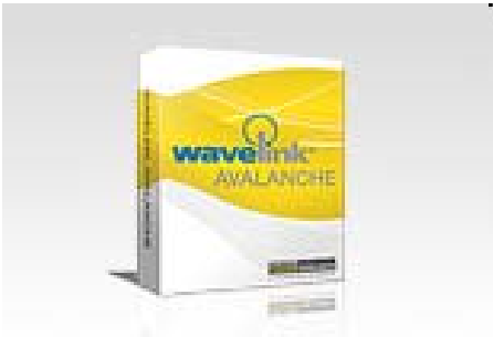
Part No: N/A, Model No: 310-LI-AV*

Device management software to help manage the mobile device fleet. Monitor device status, run activity reports, install and update software. Plus troubleshooting, configuration, security and back-up.