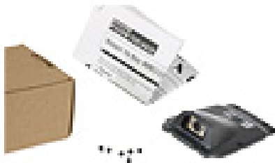
2D Slim Pod HHP 5180 Imager

Compatible with pistol grip WA6102-G1 as well as with G1 and G2.