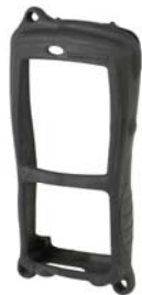
Part No: N/A, Model No: WA6404