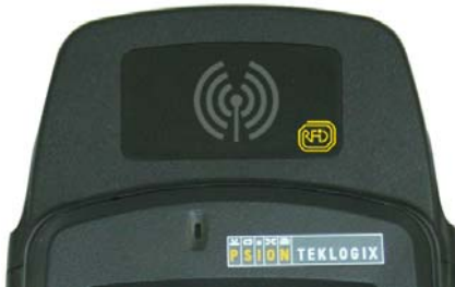
Part No: 1051270, Model No: HF-AM1-G2

HID USB HF Multi ISO (15693 & 14443 & NFC) RFID Kit Multi ISO, multi protocol High Frequency (13.56 MHz) RFID reader with integrated horizontal antenna. Reader housed inside multi purpose end-cap and is available with GSM antenna shroud only (p/n 1051270). Uses USB interface.