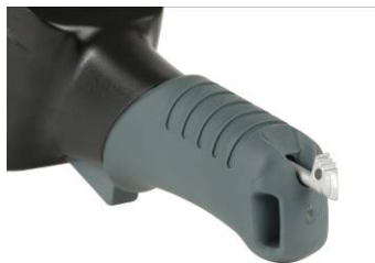
Part No: 1050459-001, Model No: WA6102-G1

The WORKABOUT PRO pistol grip attachment allows users to convert the WORKABOUT PRO to a convenient pistol grip unit. This WORKABOUT PRO pistol grip works with the WA9000-G1, WA9003-G1, and WA9005-G1 and it is compatible with G1, G2 and 3 models. The pistol grip comes with 4 screws and a printed instruction sheet. (Instructions are also available electronically).