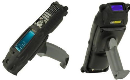
Part No: N/A, Model No: WA6402