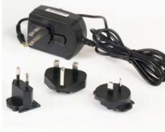
Part No: 9001904, Model No: PS1050-G1