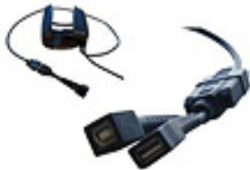
Part No: 1050551, Model No: WA1001

This extremely rugged, heavy-duty universal mounting system with 1" ball joints, allow the Vehicle Cradle to be mounted in any vehicle providing easy access to the WORKABOUT PRO. This universal mounting system has locking joints and allows attached terminals to be adjusted three-dimensionally giving maximum display readability and device usability.