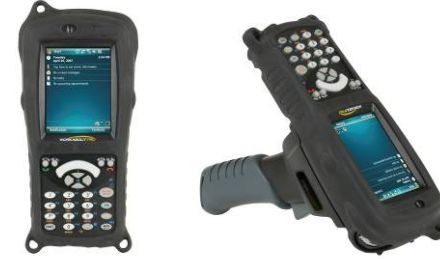
Part No: N/A, Model No: WA6401