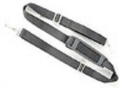
Part No: 30585, Model No: N/A