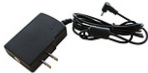
Part No: 1080220, Model No: CA1067

The Single Battery Charger charges standard or High Capacity batteries one at a time. An appropriate power lead should be ordered at the time of purchase. (Universal Power Supply comes with the lead.)