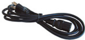
Part No: 9008693, Model No: N/A

The Quad Battery Charger is capable of charging four batteries at once and can charge either Standard or High Capacity batteries. It comes with a Universal Power Supply. An appropriate power lead should be ordered at the time of purchase.