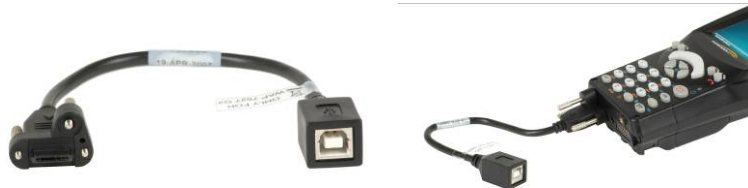
Part No:N/A, Model No: WA4001-G2

Enables users to connect USB A terminated devices (such as printers, scanners, GPS module) to the WORKABOUT PRO, 3 point tether connector improves strength and stability when connected to the device.