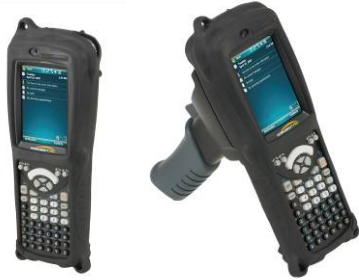
Part No: N/A, Model No: WA6400