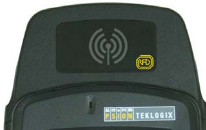
Part No: 1009098, Model No: LF-AH1-A1

Multi protocol Low Frequency (125 & 134.2 KHz) RFID reader with integrated horizontal antenna. Reader housed inside multi purpose end-cap and is available with GSM antenna shroud only (p/n 1051330). Uses USB interface.