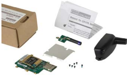
Part No: N/A, Model No: RA3030-G2