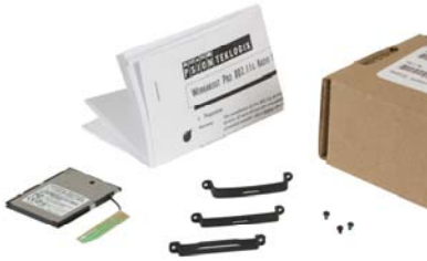
Part No: N/A, Model No: RA2041