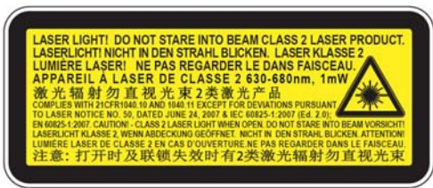
Figure 3.1 Laser Safety Label